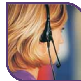
SYSCARE SUPPORT & MANAGED SERVICES