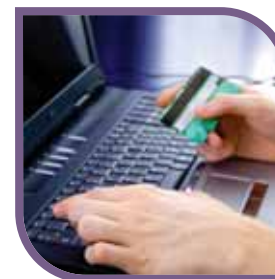
SECURITY & IDENTITY MANAGEMENT