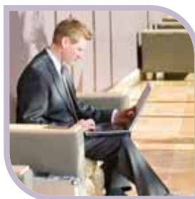
UNIFIED COMMUNICATIONS & WIRELESS