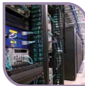
STORAGE VIRTUALISATION & CONTINUITY